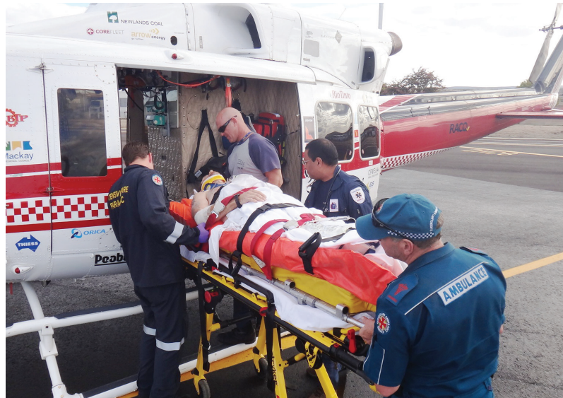
HOSPITAL TRANSFER FOR PATIENT WITH CRITICAL INJURIES

DONATIONS OF $5,000 OR MORE ENSURES YOUR LOGO IS ADDED TO www.cqrescue.com.au UNDER THE 'CORPORATE SUPPORTERS' SECTION.